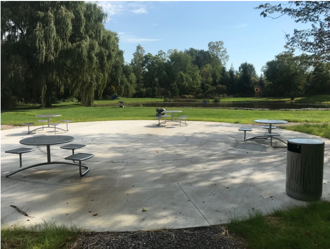
New concrete pad with park benches overlooking pond at the rear of the property.