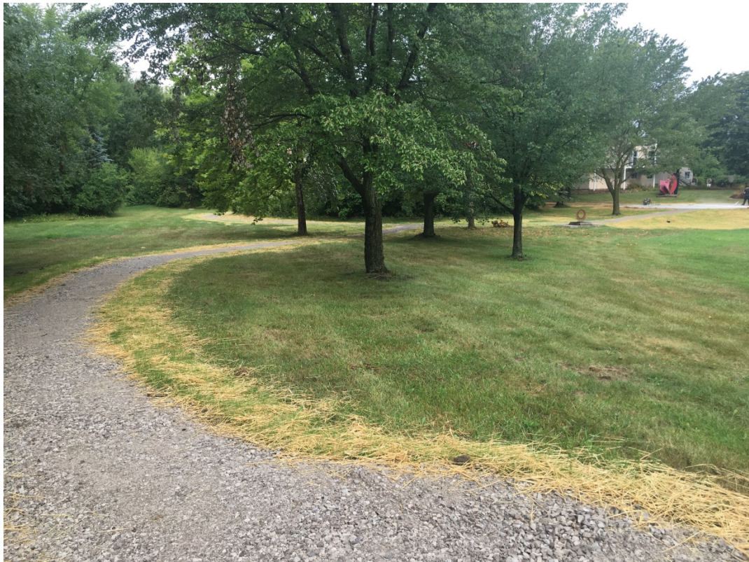
Newly installed five-foot wide gravel pathway around the property.