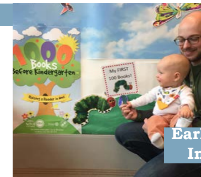
Early Literacy Initiatives

The Library has a Local Author/Artist Collection for anyone living in Novi seeking to highlight their work and share it with a larger audience.