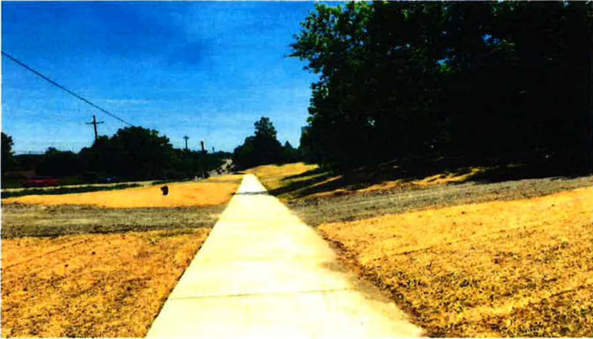
West End (at Marlin Road) – Looking east towards M-5