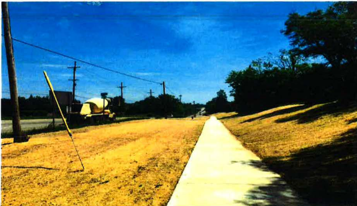
Overall – Looking east towards Haverhill Farms