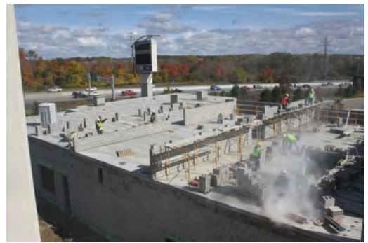
Hyatt Place construction in progress for a Spring/Summer, 2013 open. (Oct., 2012)