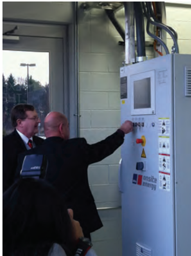
Mayor Gatt activates natural gas-fueled Combined Heat and Power plant (CHP Solutions) for Tognum (Nov, 2012)