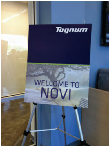
Tognum America opens its new corporate offices with a tour to city officials (Aug., 2012)