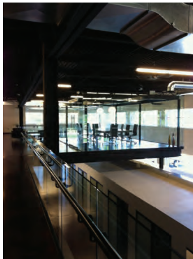
Macprofessionals unveils their new state-of-the-art 45,000 sq. foot headquarters (Jan., 2012)