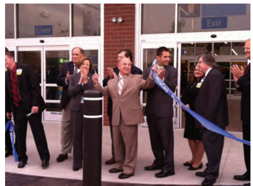
Rebirth of the Novi Town Center included the opening of several new retail stores and restaurants including Wal-Mart this past summer