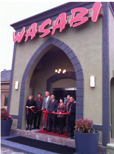
Wasabi Steakhouse, one of several new restaurants that opened in 2012 (Feb., 2012)