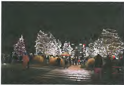
In addition to the Holiday Tree, 12 other trees were decorated around the campus of the Novi Civic Center making it a destination for families to come and visit.

This annual community event was made possible by almost $9,000 in sponsorships from ITC, Community Financial, Best Buy, DTE, Twelve Oaks, Bright House Networks, Walmart, Tyler/Dumas/Reyes, Paradise Park, and Novi Youth Assistance. Local restaurants - Bagger Dave's Burger Tavern, Buffalo Wild Wings, BD's Mongolian Barbeque, Max and Erma's, Olga's Kitchen, and the Read A Latte Café generously provided yummy food bites. This event keeps growing every year, and 2013 promises to be even better. It benefits the community by bringing everyone together and providing a night to celebrate the holiday season together. Special thanks to all the City Departments, and the facility crew who helped to facilitate the event. Enjoy the photos below.