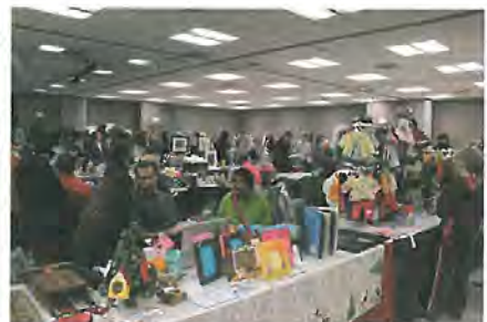
This year featured a 48 vendor craft show. This was double the size of 2011, and provided a great way for the citizens of Novi to begin their holiday shopping.