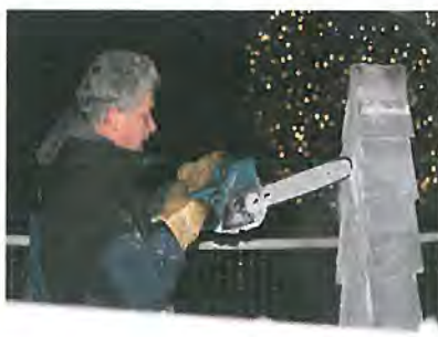
Frozen Images provided an ice sculpture for families to see. This year it was a holiday tree. This was placed close to the reindeer as well.