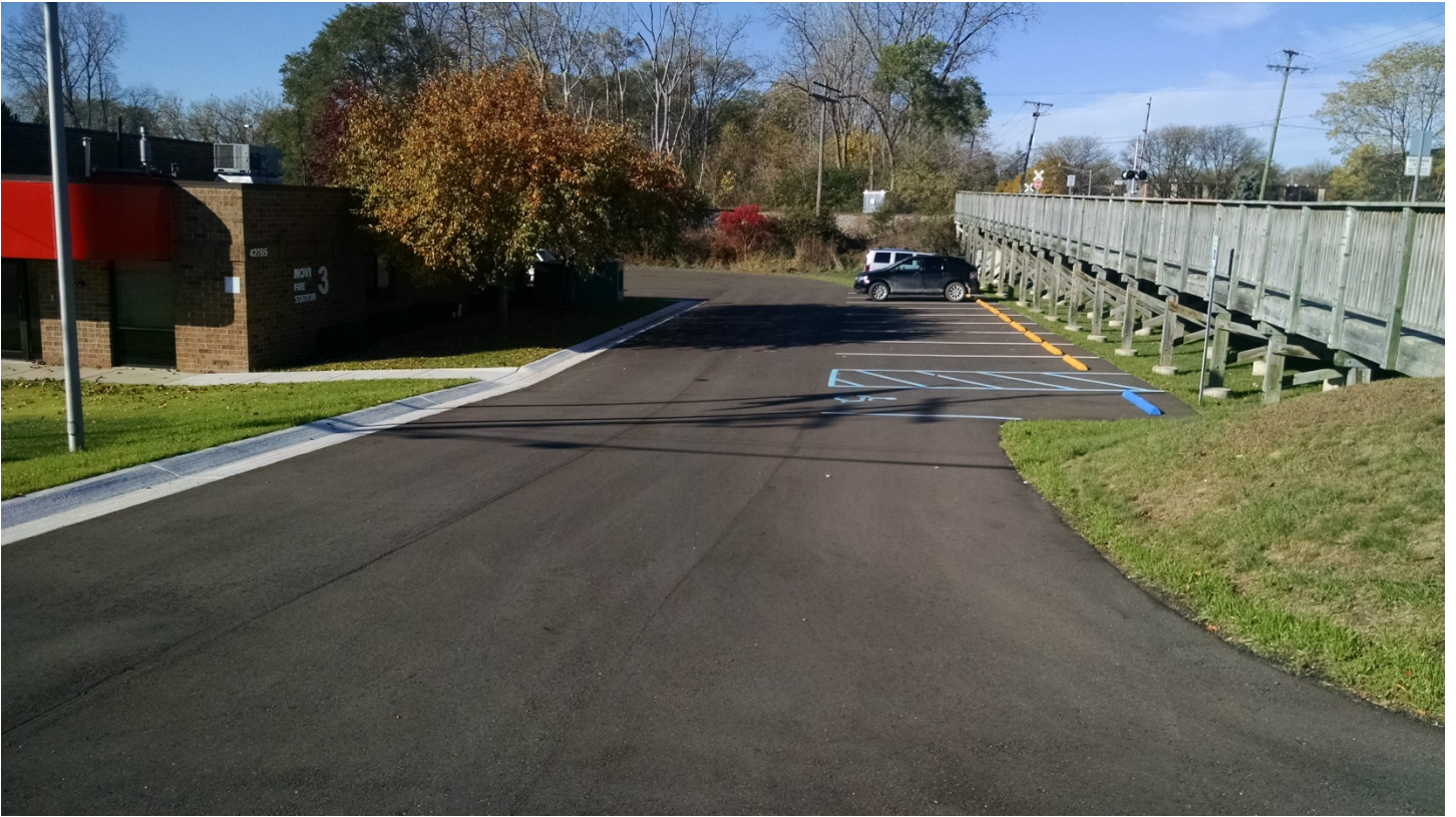
North Entrance and Parking Lot from Roethel Drive, looking west.