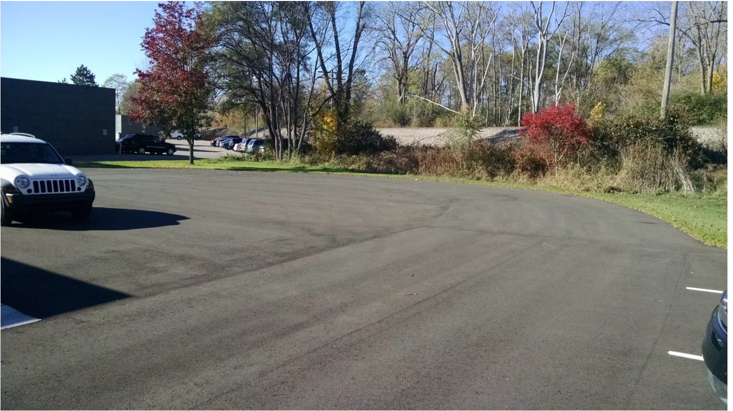
Rear Parking Lot Area, looking southwest.