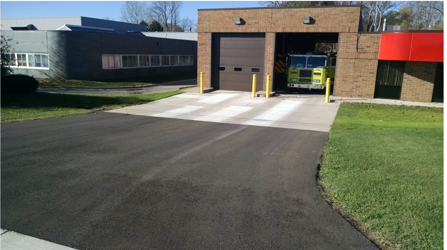
South Garage Entrance from Roethel Drive, looking west.