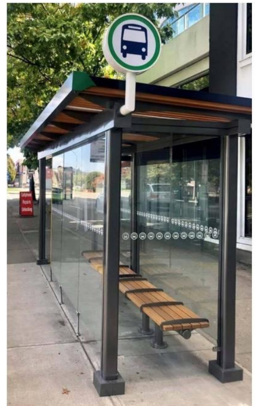
City of Abbotsford, CA

Please note that the Slimline Hip, as optioned, is $1,975 less expensive than the Eclipse Arch. Both quotes include a 6' bench, providing sufficient space for wheelchair accessibility and ensuring ADA compliance.