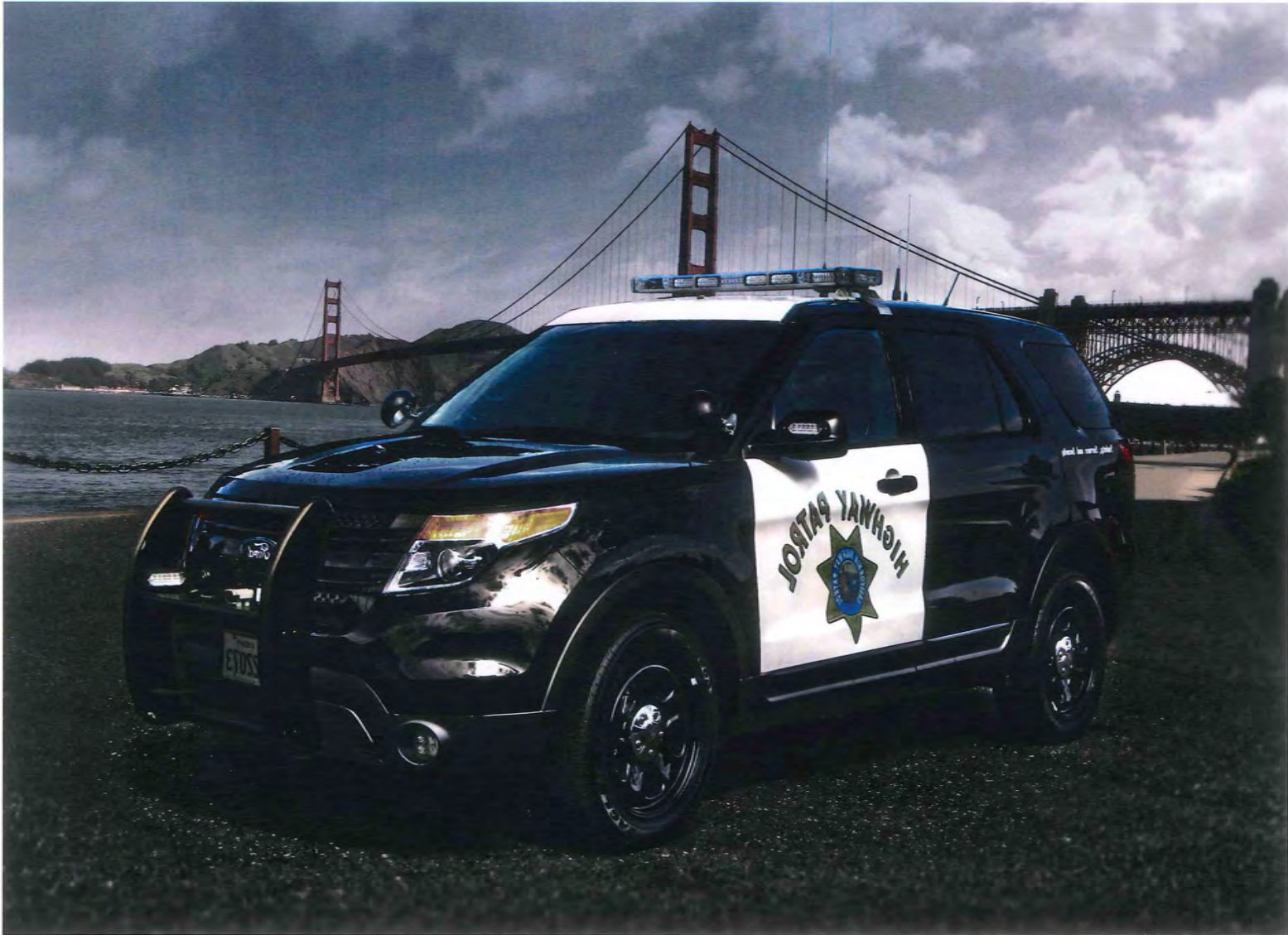
Ford Explorer Police Interceptor