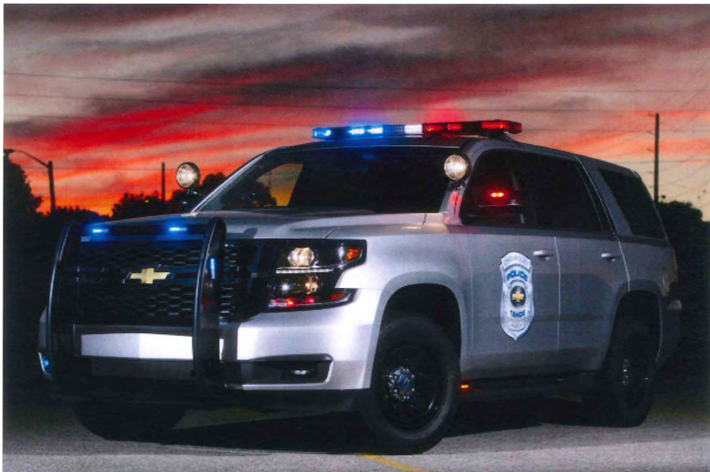
Chevrolet Tahoe 4WD