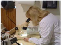
A2LA Accredited Soil Testing