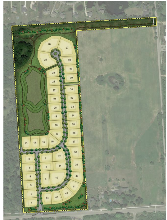
Figure 6: Parc Vista Plans, as provided by the applicant.