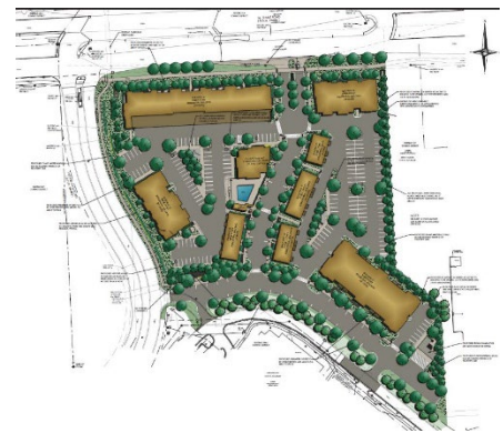
Figure 2: Griffin Novi Plans, as provided by the applicant.

Public hearing at the request of Singh Development, LLC for JSP 20-27 Griffin Novi for Planning Commission's recommendation to the City Council for approval of a Preliminary Site Plan with a PD-2 Option, Special Land Use permit, Wetland Permit, and Stormwater Management Plan approval. The subject property is located at the southeast corner of Twelve Mile Road and Twelve Oaks Mall access drive in Section 14. The applicant proposes to utilize the Planned Development 2 (PD-2) option to develop 174 multi-family residential units. A private street network is proposed to connect the development to Twelve Mile Road and the Twelve Oaks Mall access drive on the west side of the property.