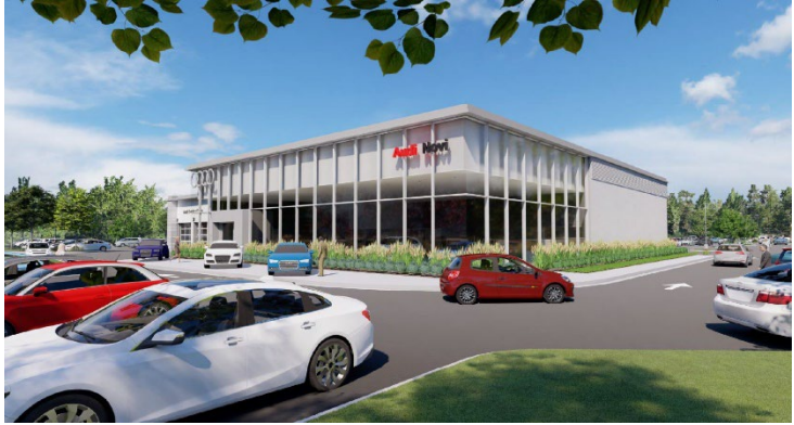
Figure 5: Audi of Novi Rendering, as provided by the applicant.

Public Hearing at the request of Lithia Motors, Inc. for approval of the Preliminary Site Plan, Special Land Use Permit, and Stormwater Management Plan. The subject property is approximately 3.91 acres and is located at the northwest corner of Ten Mile Road and Haggerty Road in the B-3, General Business Zoning District. The applicant is proposing to demolish a former Jaguar Car Dealership and redevelop the site in order to build an approximately 11,935 square foot two-story car dealership building to be used by Audi of Novi along with associated parking, vehicle inventory, and site improvements.