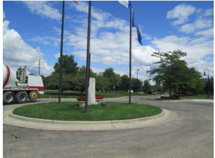
North Entrance Area