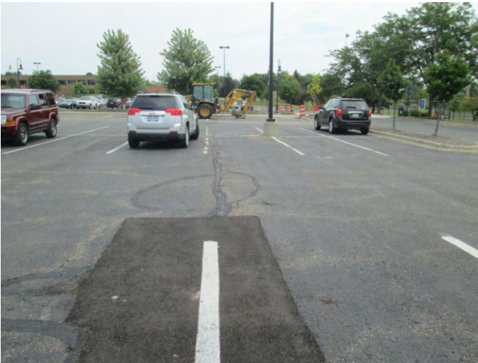
Civic Center Main Lot Area