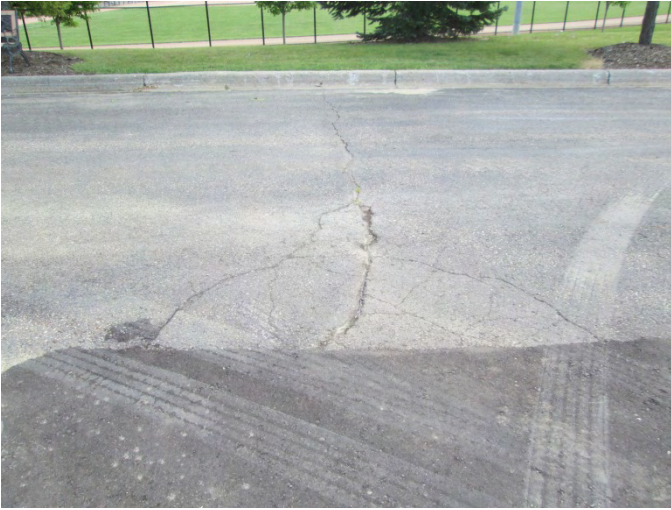
Civic Center Main Lot Area