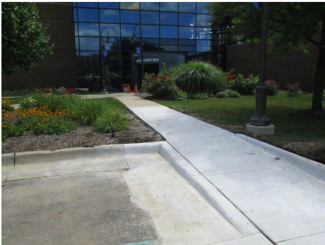
North Entrance Area

The estimated cost for the recommended improvements is $391,000 for the Main Lot and Novi Way access roads and $40,000 for the north entrance area.