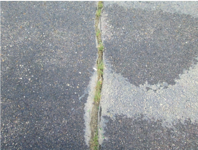
Civic Center Main Lot Area