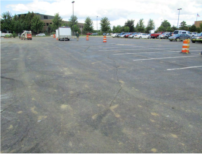
Civic Center Main Lot Area