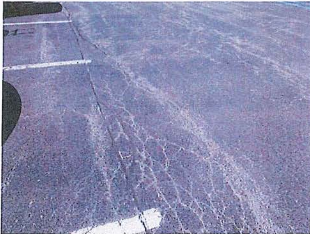
Police Station West Lot