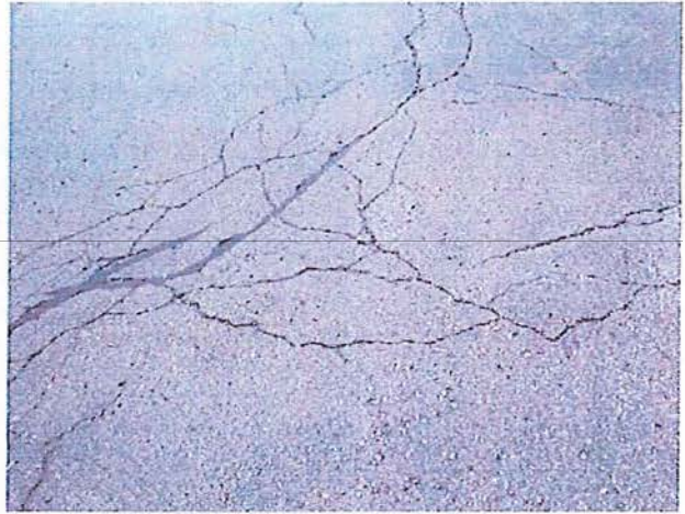
Police Station West Lot