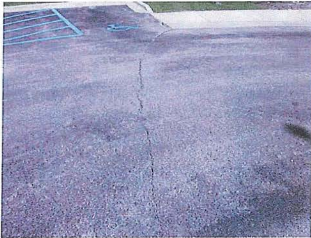
Police Station West Lot