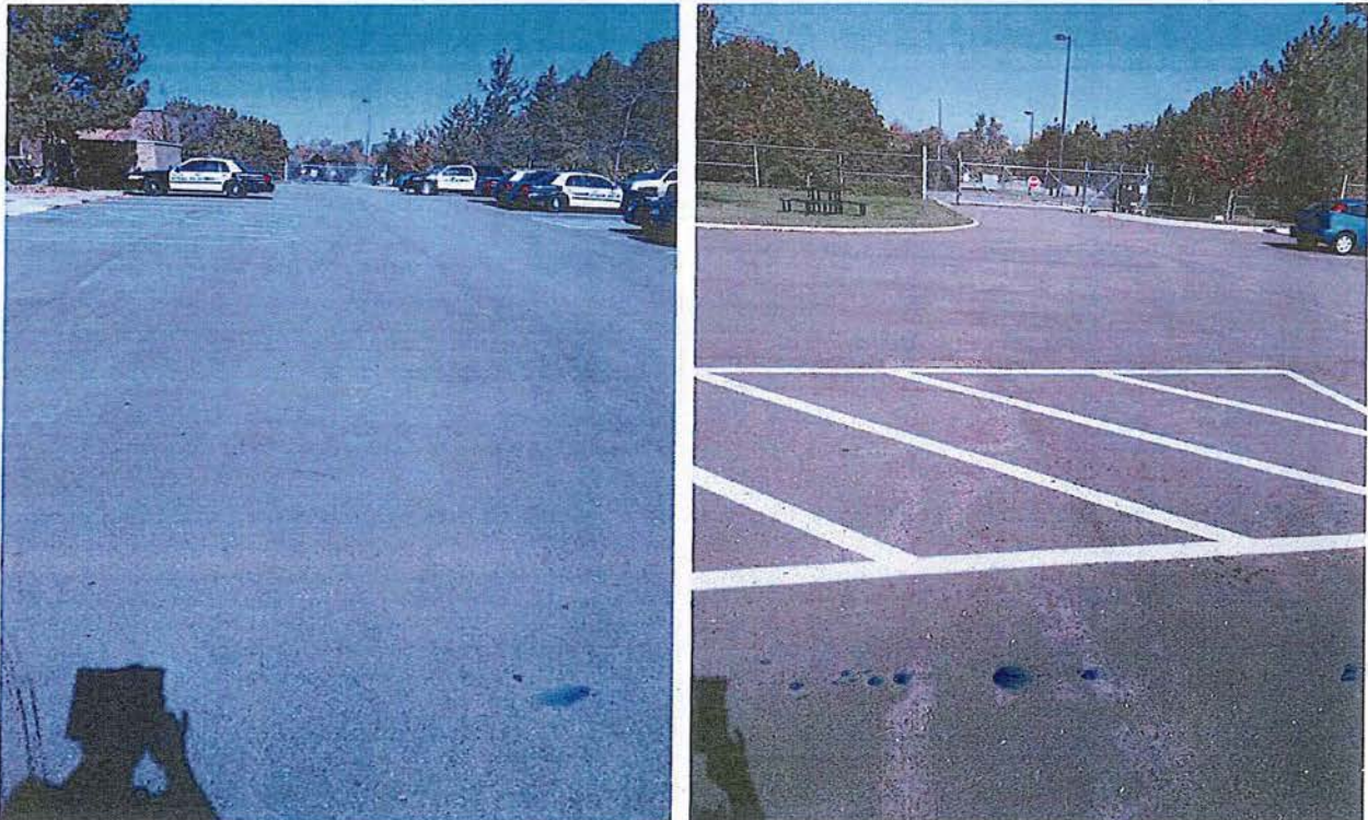
Police Station East Lot

The west lot is connected to the Civic Center campus and was rehabilitated in the fall of 2013. We recommend overband crack sealing to keep this pavement in good condition. Cost for the overband crack sealing is estimated at $1,200.