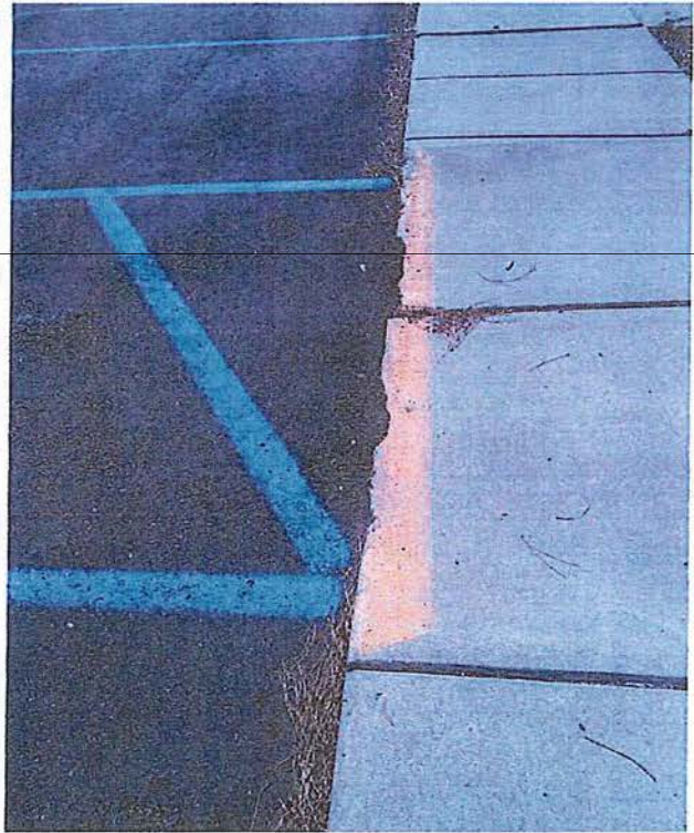
Police Station East Lot