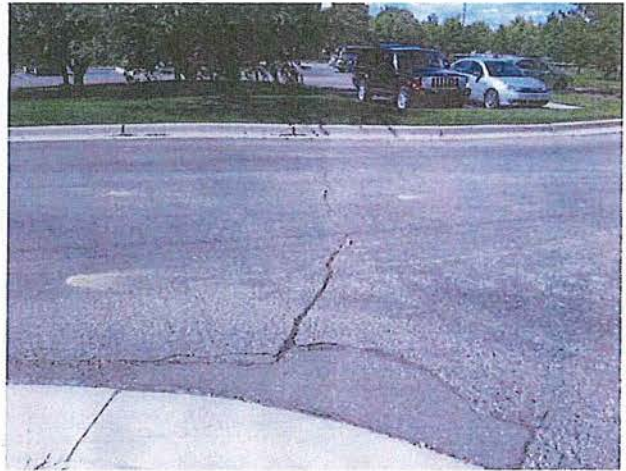
Police Station West Lot