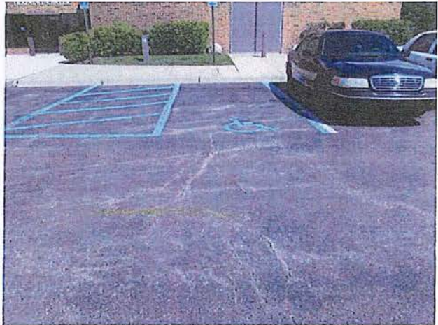
Police Station West Lot