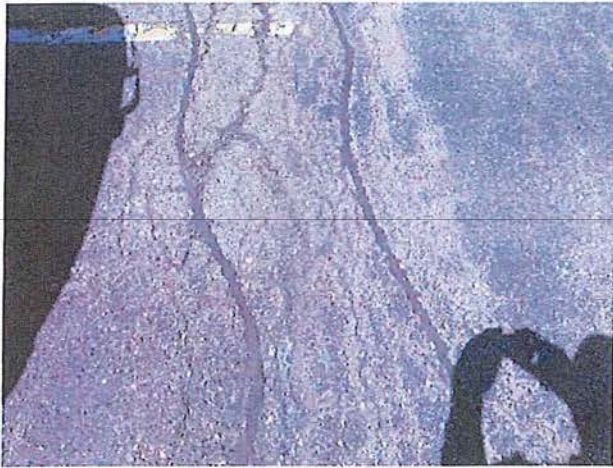
Police Station West Lot