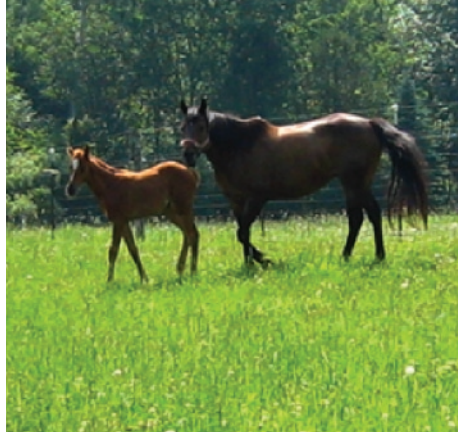
Good pasture management

Keeping livestock out of waterways is the preferred management practice to prevent manure and stream bank erosion from affecting the water resource. A convenient method to accomplish this is fencing.