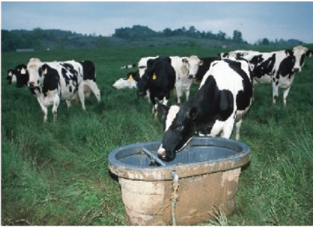
Acceptable water source

Buffer strips are sections of land that contain a variety of vegetation, including trees and shrubs, that helps protect the water resource, benefit wildlife and provide needed shade for surface waters. Trout, which require much colder water than other types of fish, benefit significantly from buffer strips.