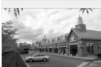
Small strip mall