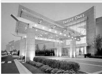
Large regional mall