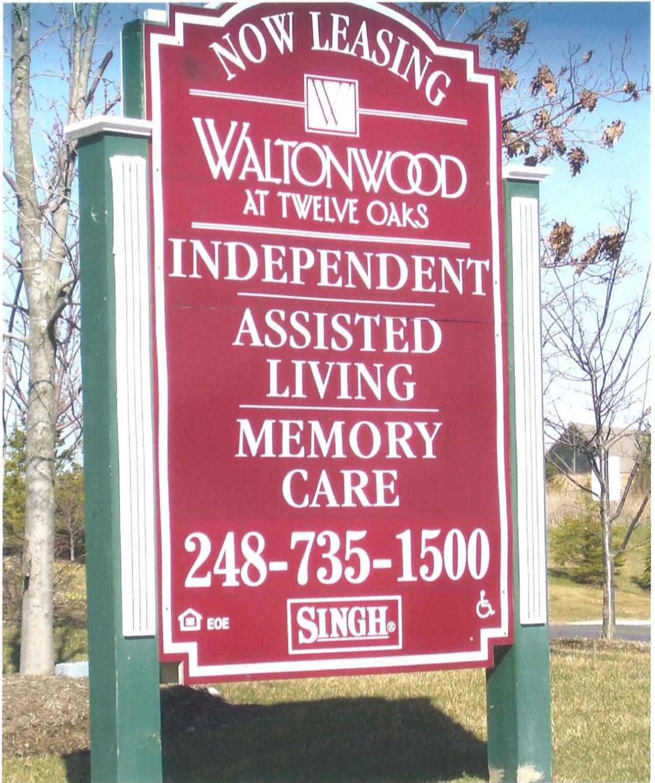
REAL ESTATE DEVELOPMENT SIGN Finger Road Location