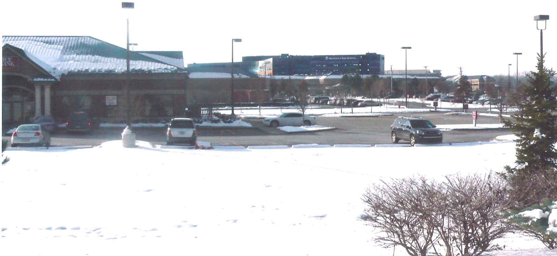
ONE (1) INTERNALLY ILLUMINATED LOGO AND LOGO LETTERS

SIGN graphix 39255 Country Club Drive, Suite B-35, Farmington Hills, Michigan 48331-3490 Ph. 248-848-1700 Fax 248-848-1722 www.signgraphix.net