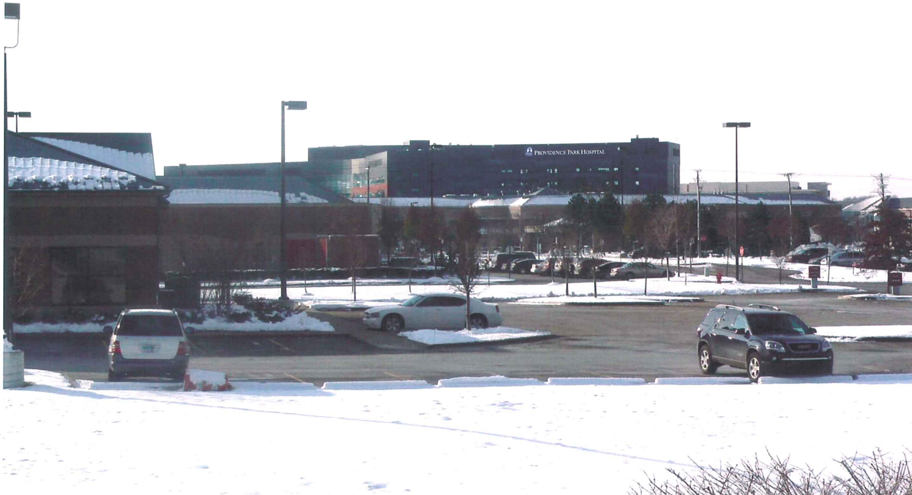
ONE (1) INTERNALLY ILLUMINATED LOGO AND LOGO LETTERS

SIGN graphix 39255 Country Club Drive, Suite B-35, Farmington Hills, Michigan 48331-3490 Ph. 248-848-1700 Fax 248-848-1722 www.signgraphix.net