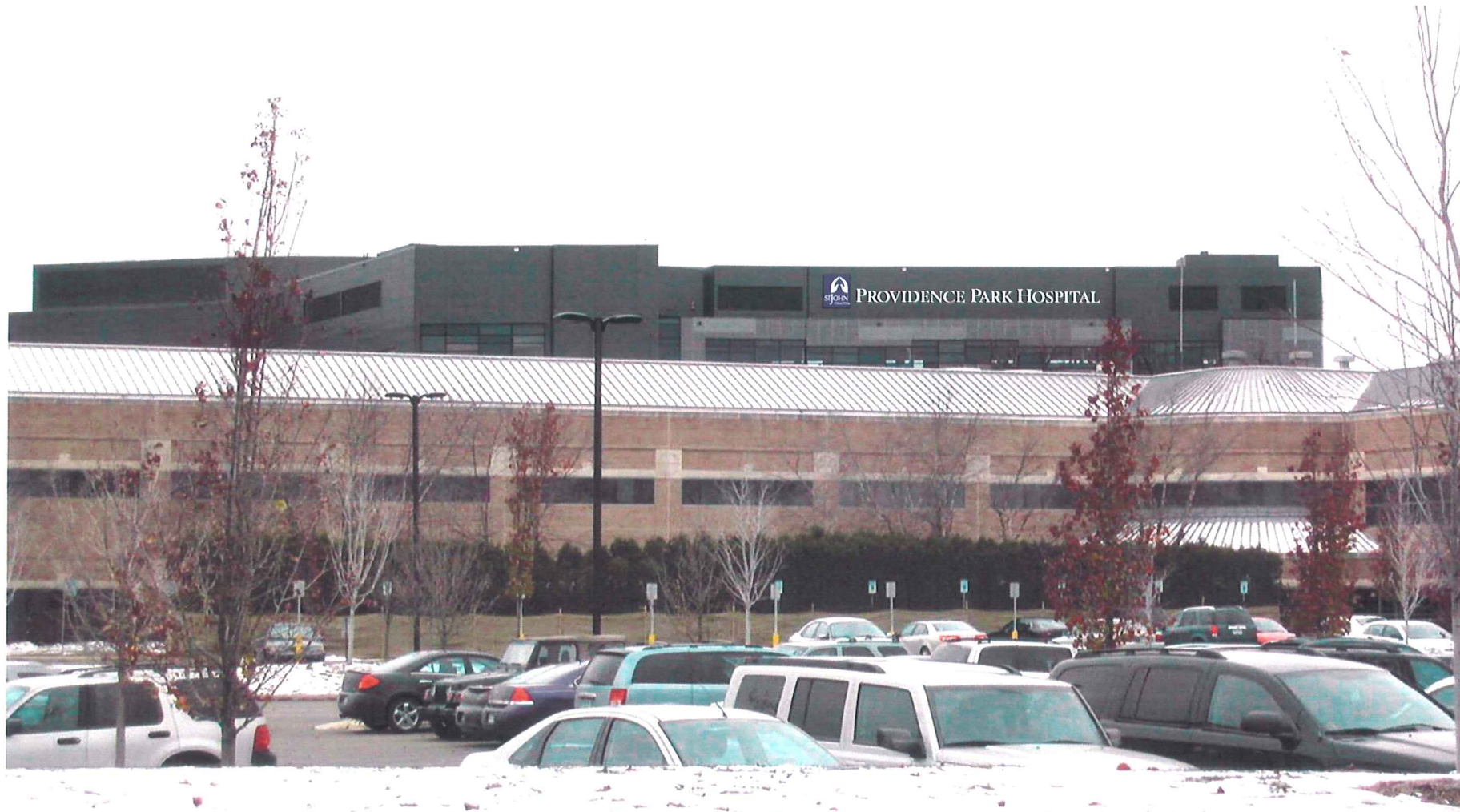
ONE (1) INTERNALLY ILLUMINATED LOGO AND LOGO LETTERS

SIGN graphix 39255 Country Club Drive, Suite B-35, Farmington Hills, Michigan 48331-3490 Ph. 248-848-1700 Fax 248-848-1722 www.signgraphix.net