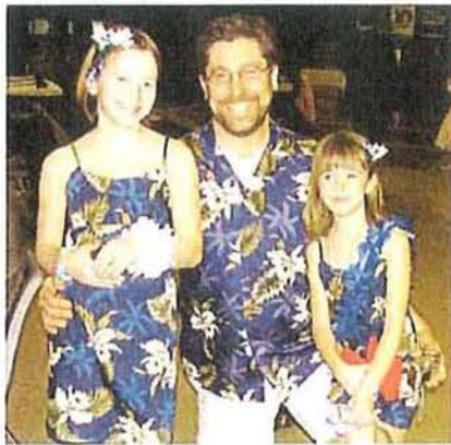
Festive attire added to the fun atmosphere at the event.

The Daddy-Daughter "Evening in the Tropics" Dance took place on Friday, February 12 and Saturday, February 13, 2010 at the Civic Center. This fun community event, which promotes strong family relationships, has been a Novi tradition for over 30 years. Over 700 participants came together to share this positive experience and build strong relationships. Many came in new dresses bought from local businesses especially for their special evening with Dad. The event featured fun physical activity through dancing. Decorations were purchases from local businesses and a variety of great food that included healthy choices, was sponsored by local businesses.