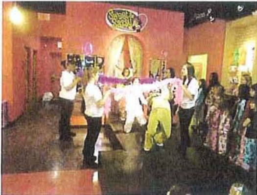
Limbo, limbo, limbo! The girls loved dancing the night away.

The Sweet & Sassy Sweetheart PJ Party was hosted in partnership with Sweet & Sassy Salon, a locally owned business. The event attracted girls ages 7-12 from Novi and surrounding communities to the Sweet & Sassy Salon to enjoy a night of pampering, music, food and fun! This new program enabled young ladies to further develop socialization skills, improve self esteem and encourage a healthy active lifestyle!