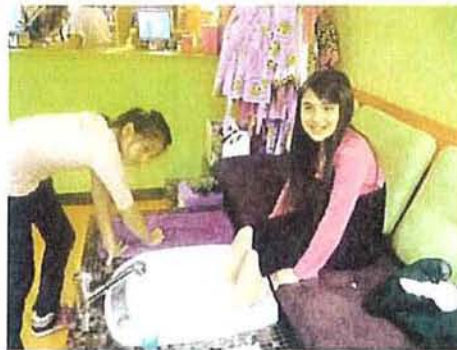
Plenty of pampering for all the PJ party goers!