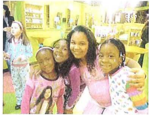
A night of glitter, glamour and smiles with great friends!