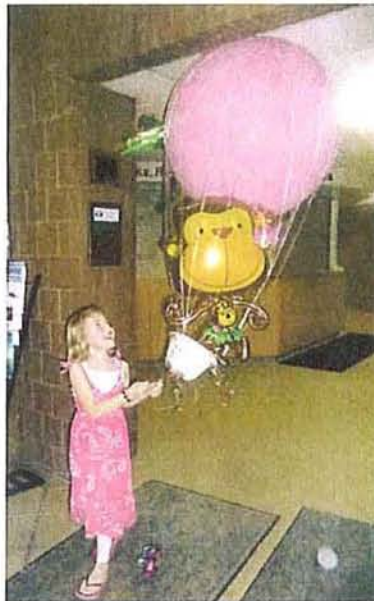
A big THANK YOU! to all our sponsors and in-kind donors who helped "Enrich Lives and Strengthen Community!"