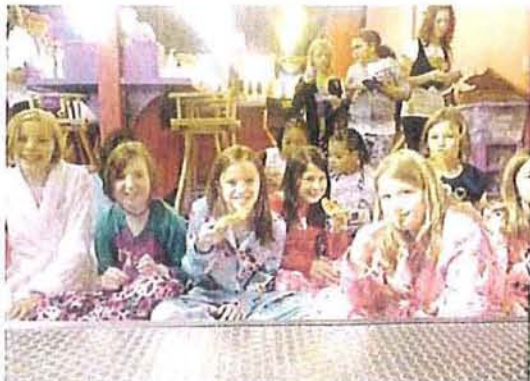
Pizza and beverages completed the perfect Sweetheart PJ Party for all the girls!