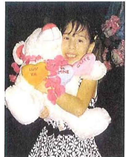
Over 100 daughters were winners of the Teddy Bear Giveaway!