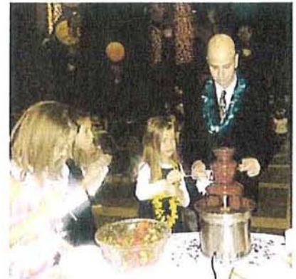
Many local businesses contributed to the wonderful array of food at the event.