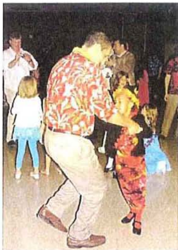
A chance to dance was had by all!