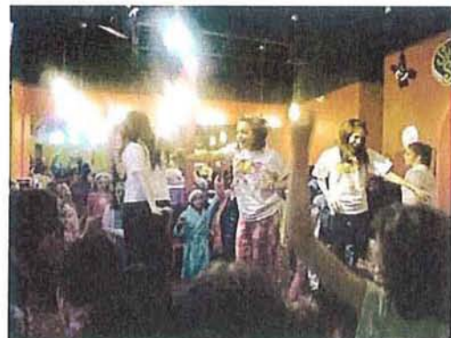
Super fun music and dances get the girls moving and grooving to some fun tunes!