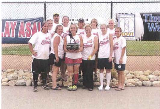
Women's E State Runner-Up Fricker's