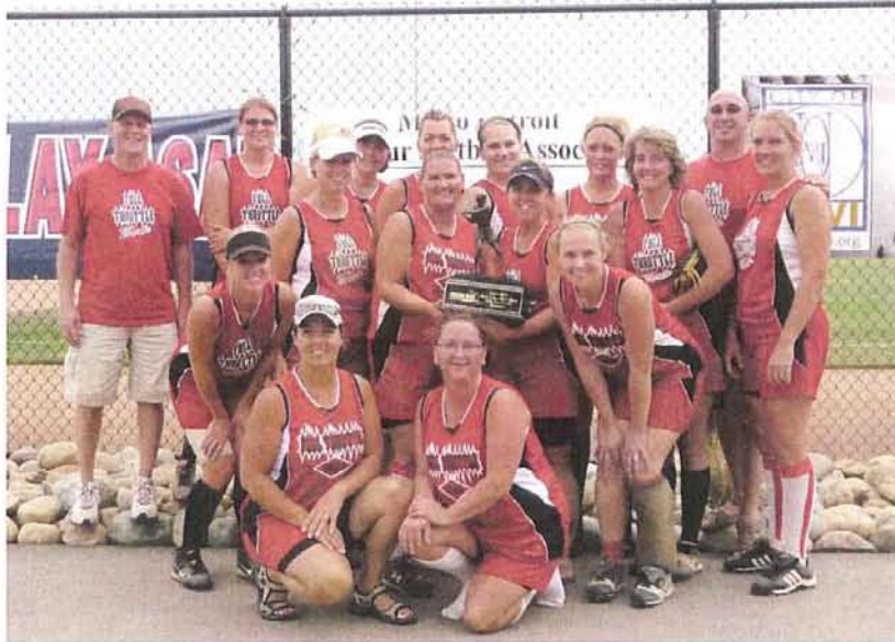
Women's E State Champions Full Throttle

The City of Novi hosted the Michigan Amateur Softball Association's 2009 Women's "E" State Slow Pitch Championships Saturday, August 1. Teams from around the state played at Ella Mae Power Park to stake their claim as the best team in Michigan.