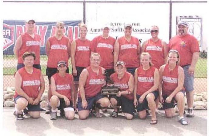
Women's E State Third Place American Legion