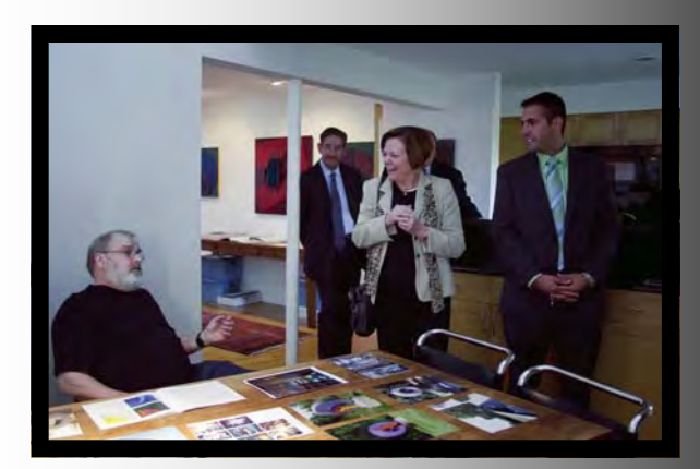
Kitchen and Dining Room area