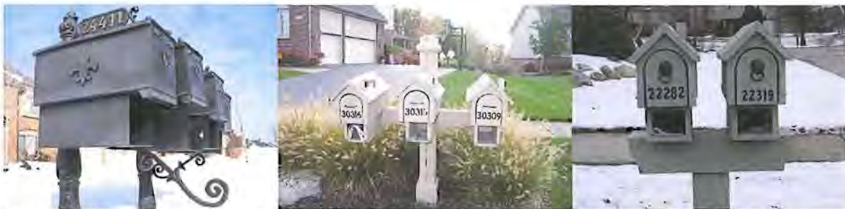
Figure 2 - Examples of Non-Standard Decorative Mailboxes Repaired/Replaced in 2011

DPS staff queried several Michigan communities (including the cities of Livonia, Farmington Hills and Sterling Heights, and Bloomfield Township in southeast Michigan) and found that none have adopted a practice similar to Novi's – especially as it relates to the repair/replacement of non-standard units. Instead, most communities have policies that call for installing a standard USPS mailbox and post, providing a flat reimbursement amount to the property owner, or allowing the owner to choose one of these two options. Policies such as these not only minimize costs, but they also reduce the number of hours spent by City crews that could otherwise be dedicated to preventive maintenance of roads and drains.