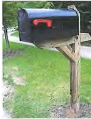
Figure 1 – Example of Standard USPS Mailbox/Post