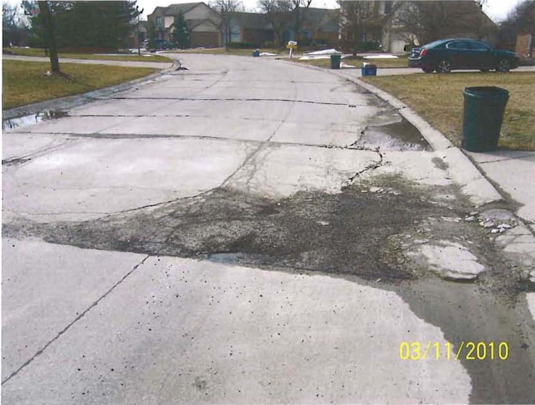
Glen Haven Circle