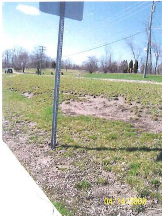
Twelve Mile East of Novi Road (View West)