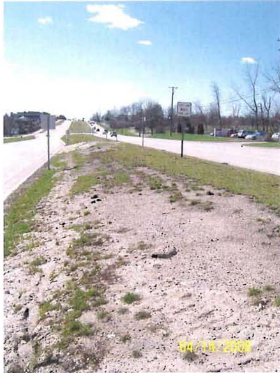
Twelve Mile East of Novi Road (View West)