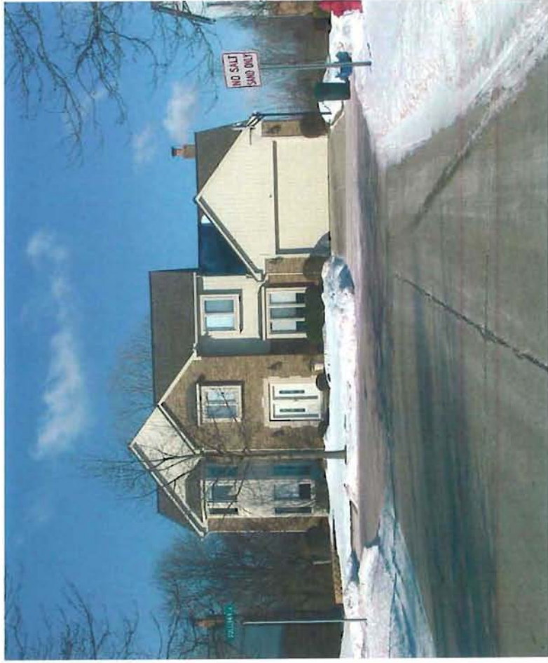
Westbound on Copland Lane