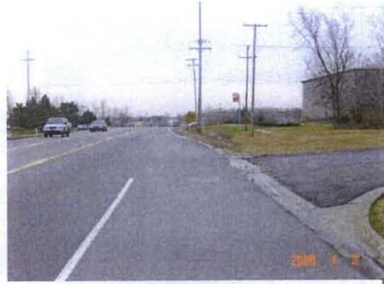
Orchard Hill Gap Overview looking south