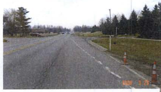
Country Lane Gap Overview looking south