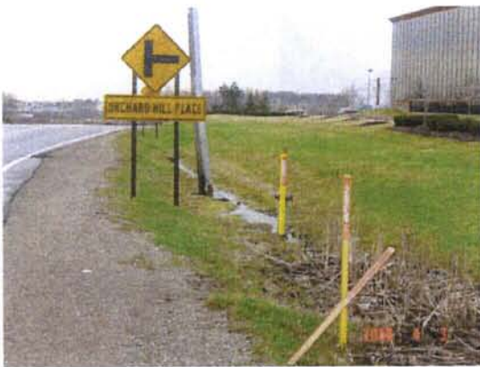
Orchard Hill Gap Obstructions looking south