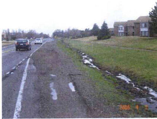
Country Lane Gap Overview looking south