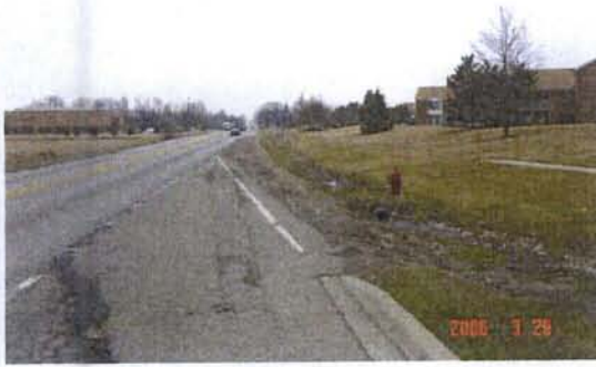
Country Lane Gap Overview looking south