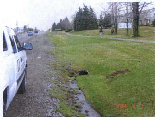
Stonehenge Gap Culvert looking south