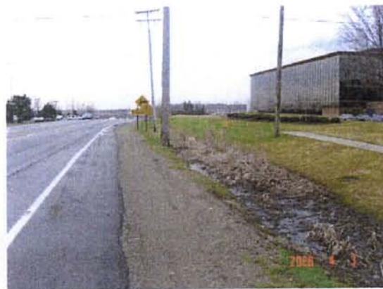
Orchard Hill Gap Obstructions and ditch looking south