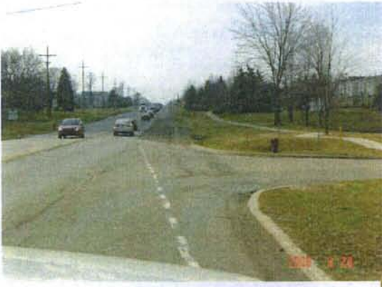
Stonehenge Gap Overview looking south