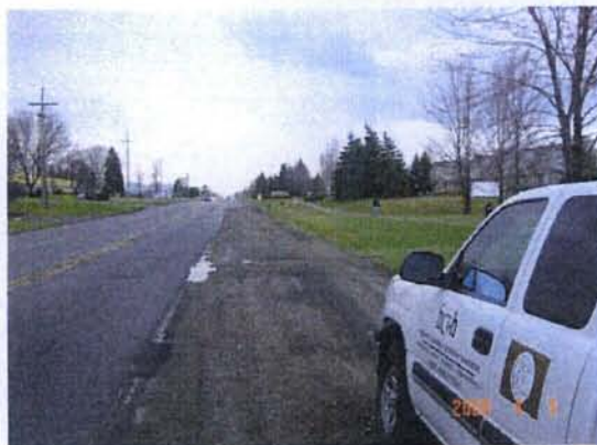
Stonehenge Gap Overview looking south